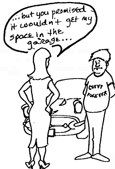
THE MISSUS SES.....

REVIEW -- this change was made 1/88 -- ARTICLE V. OFFICERS, Section 1. Stated the following: ".....One member of the Association at-large, other than an officer and who resides in the Fairbanks area, will be appointed for one year to coordinate with the Fairbanks and Anchorage membership....." MOTION WAS VOTED ON AGAIN IN JANUARY, 1989, PASSED WITH OPPOSITION.