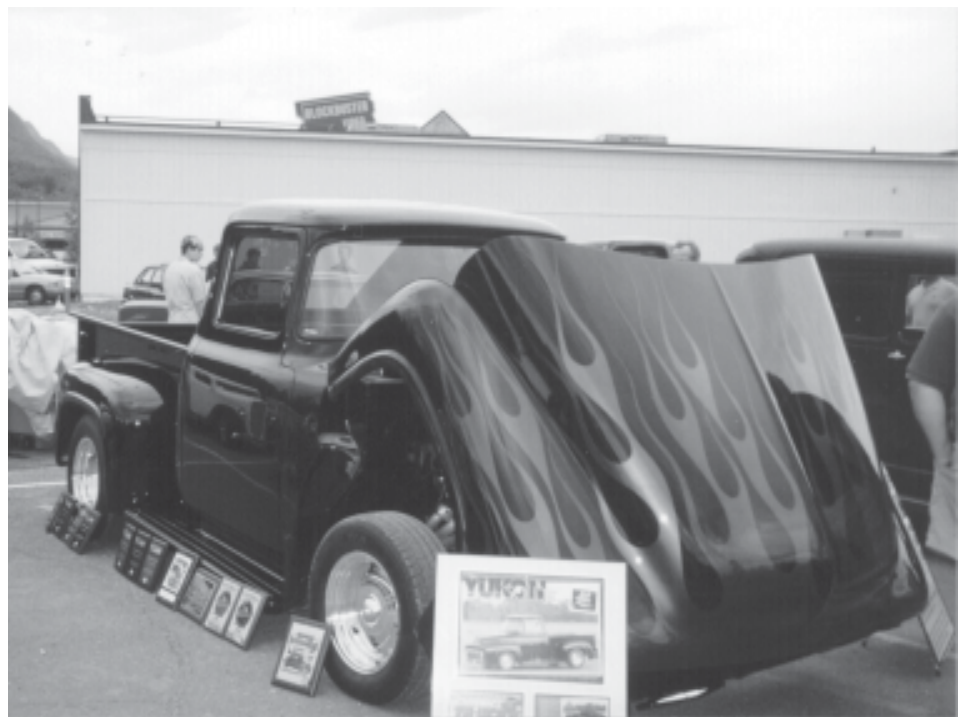
Dick Braucht took home Best Truck with Yukon Gold , his outstanding black '56 Ford Pick Up that was featured in Classic Truck magazine.

LATEST BUMPER STICKERS on a motorhome "Home is where we park it!"