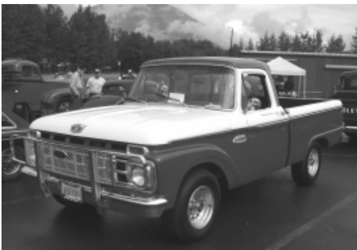
EJ Boullion made the trip in his good looking '65 Ford PU.