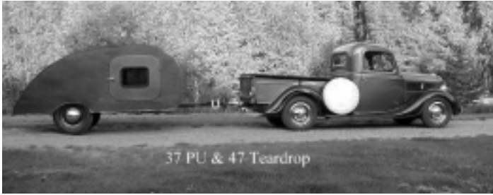
37 PU & 47 Teardrop