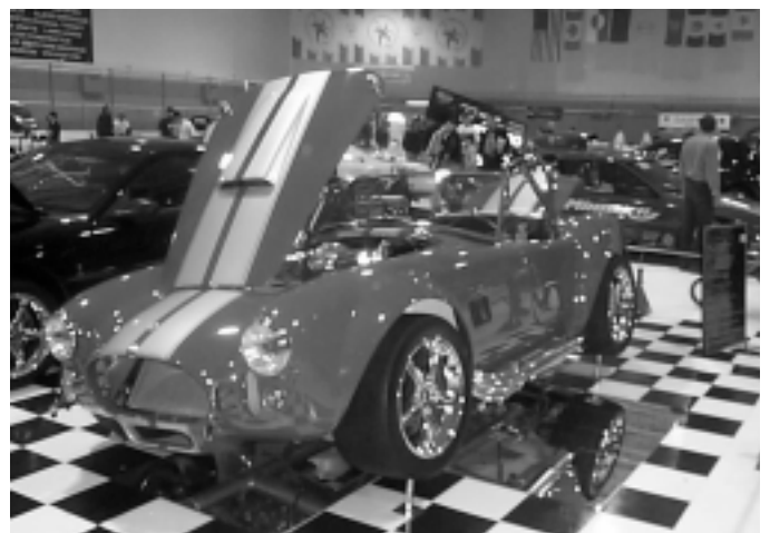
RICK LYSOGORSKI'S ICSA SHOW STOPPER 1965 SHELBY COBRA WALKED OFF WITH LAST YEARS PEOPLE'S CHOICE AWARD

For exhibit or vendor information contact Performance Promotions (907) 566-2346 in Anchorage (253) 884-1707 fax email d@sport77.com Check out our web site www.sport77.com